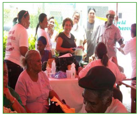
Belize Social Security Booth