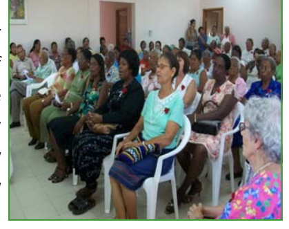
Mothers day Program

are designed to show appreciation to older mothers and fathers in the community and activities includes music, singing and prizes for the oldest mother and father.