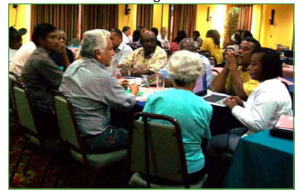
Situational Analysis of Older Persons National Forum Work group discussing Housing and Living Conditions

On June 2, 2010 the NCA held a National Forum on the findings of the Situational