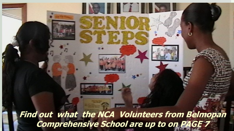
Find out what the NCA Volunteers from Belmopan Comprehensive School are up to on PAGE 7