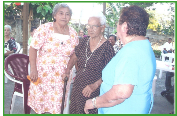
VOICE Corozal Christmas Party 2010