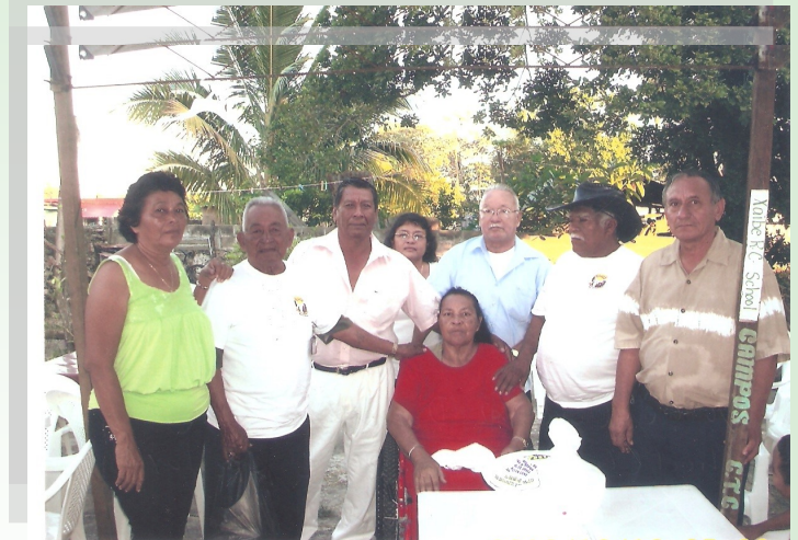
VOICE Corozal Reports PAGE 3