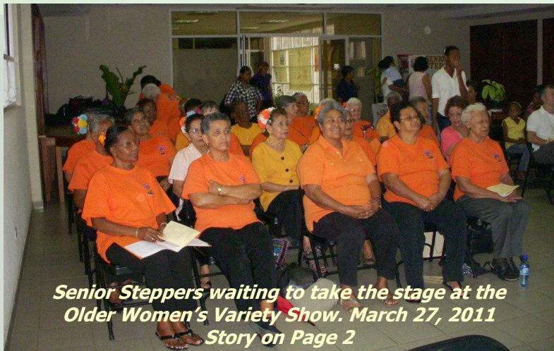
Senior Steppers waiting to take the stage at the Older Women's Variety Show. March 27, 2011 Story on Page 2