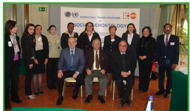
Staff of IINA and Participants of the Social Gerontology Course 2011

This course has indeed broadened my perspective on ageing and ageing issues and I