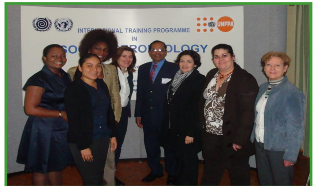
Participants of the Social Gerontology Course 2011 Sleima, Malta

and site visits. Participants were asked to prepare and present a country report