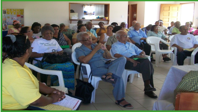
VOICE Annual General Meeting 2011 Hazel Hutchinson Center, Belmopan

The NCA, through the SIF project, presented each VOICE group with a new computer and printer to be used for the enhancement of VOICE in each district.