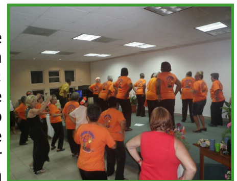
Senior Steps Dancers Performing the Macarena

dancing in the round by ten Senior Steppers; a Salsa routine and a Mestizo cultural dance featuring four dancers in costumes they had hand paint-