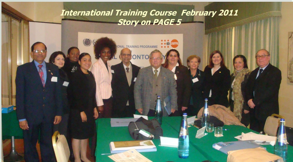
International Training Course February 2011 Story on PAGE 5