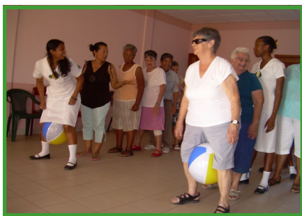
Volunteers taking part in Senior Steps on Monday

The girls joined in the dancing with the Senior Steppers on Monday afternoons and assisted with the preparations for the Senior Women's Variety Show. They were responsible for creating the Senor Steps donation box and display. The NCA would like to thank these girls for their service and wish them the best as they enter their fourth and final year of high school.