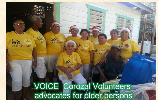
VOICE Corozal Volunteers advocates for older persons

Older persons standing up for their rights and wanting to make changes in society that improve the quality of life for older people.