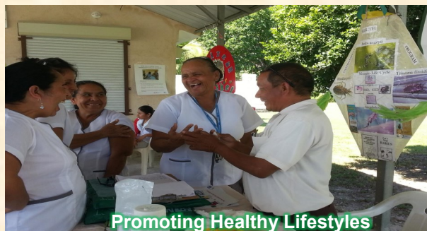
Promoting Healthy Lifestyles