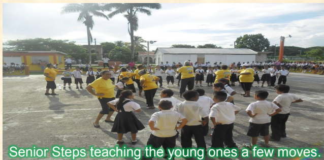
Senior Steps teaching the young ones a few moves.

Building an Ageing Friendly Society in Belize will enable Older Persons to freely participate and contribute their knowledge and skills to the continued development of the country.