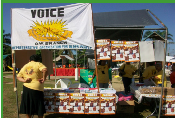
VOICE ORANGE WALK'S INFORMATION BOOTH AT THE BELIZE CITY NGO FAIR