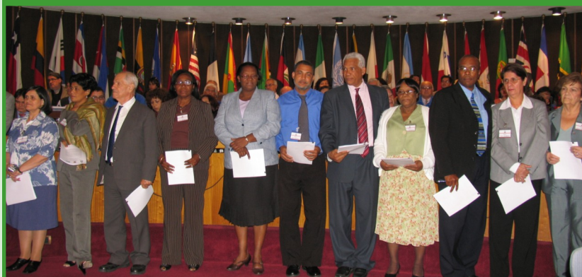
COUNTRY DELEGATES RECEIVING THE DRAFT CONVENTION ON THE RIGHTS OF OLDER PERSONS, ECLAC HEADQUARTERS SANTIAGO CHILE